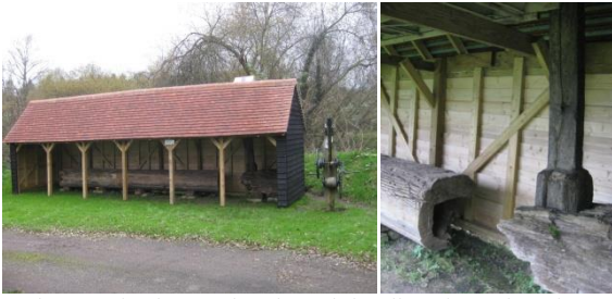
The vertical 'monk' closed the flow into the pipe

Regular working parties have continued on Tuesday mornings and have been convivial and well attended. The shelter for the timber drain pipe from the Glasshouse fish pond in Stag Park is finished.