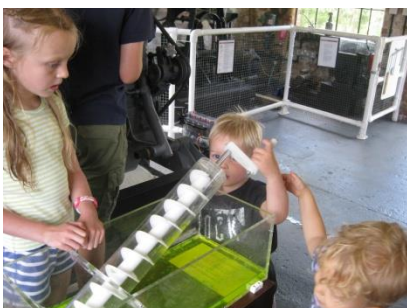
Young interest in model Archimedes Screw

The turbine has had a better year although generation has been lost due to low water levels and faulty capacitors, which have been rewired. The total generation in the year ending 30 September 2017 was 87,808 kWh at a load factor of about 67%.