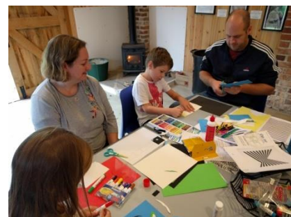
Big Draw Day in the Warehouse

Our registration to participate in the nationwide Big Draw went astray. The Trust nevertheless held a Big Draw event on Sunday 1 October. Materials were provided with expert tuition. Although the day was wet (as 2016!), families had an entertaining afternoon responding to the 'Moving Lines' theme.